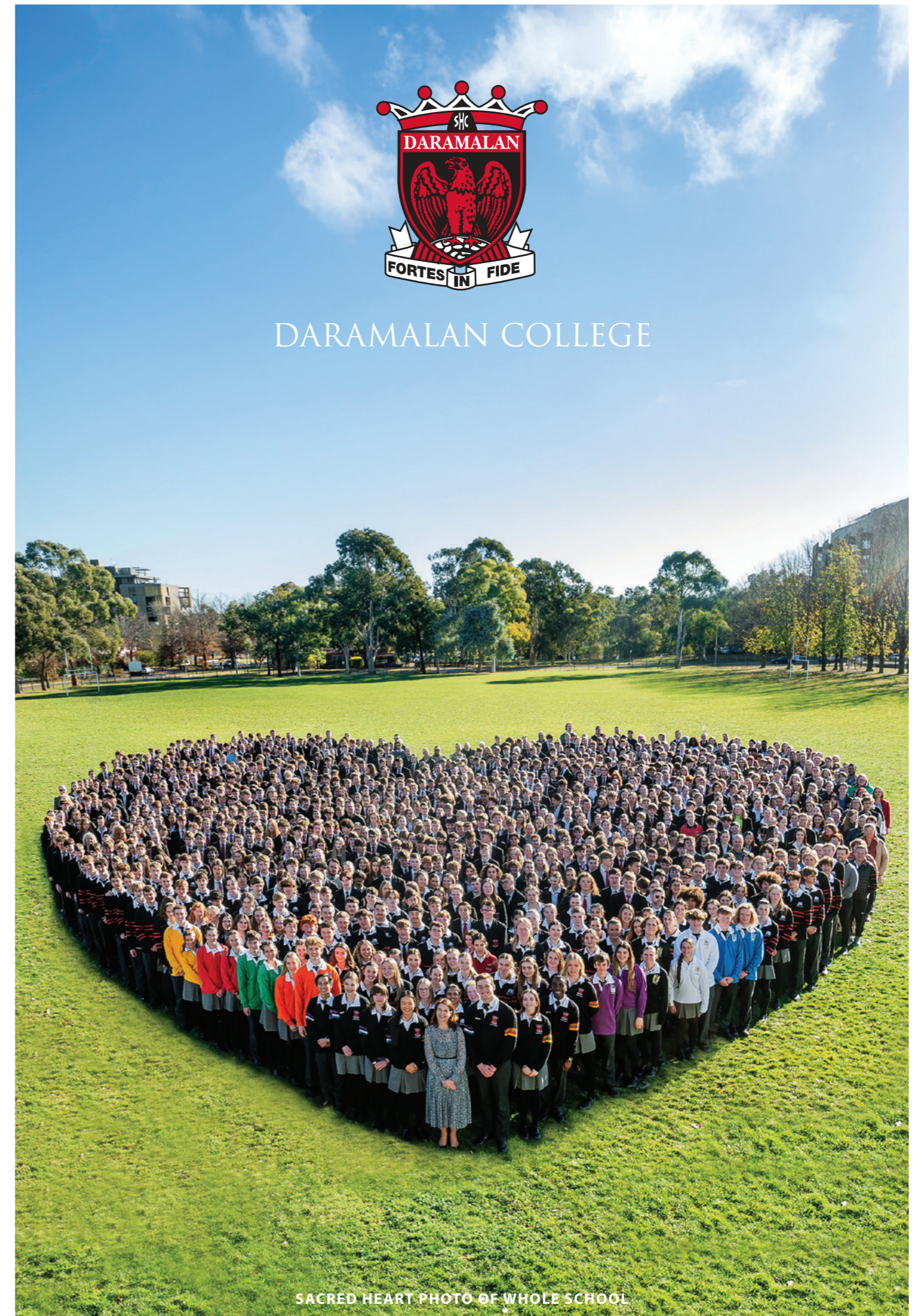
SACRED HEART PHOTO OF WHOLE SCHOOL