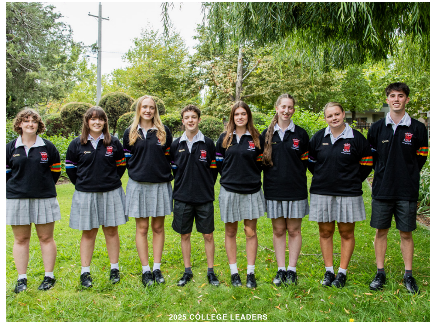
2025 COLLEGE LEADERS